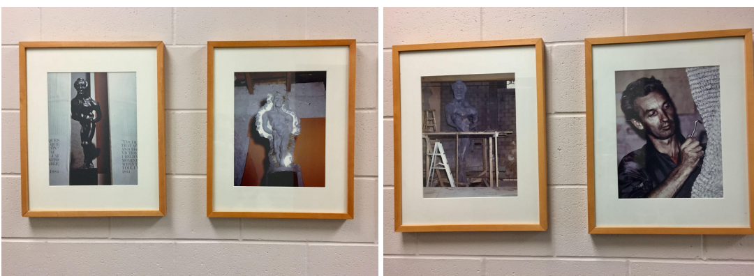
The hallway and photographs depicting Lemay’s artistic process. The ‘exhibit’ also includes a brief biography of Lemay and the Riel sculpture.