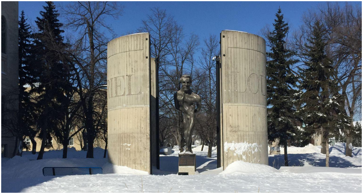
Maurice Lemay, Riel , 1970.

Lemay chose to depict Riel in an expressionist fashion. The three-metre tall bronze statue stood on a round plinth surrounded by ten-metre high half-cylindrical concrete shells. These walls largely obscured the monument from view unless the spectator approached it from the front or back. Riel was presented as nude, twisted and misshapen with his hands held behind his back. In an interview with the Winnipeg Free Press , Gaboury stated: “[I want] to bring out the anxiety and to express the conflict of Riel. I want people to feel Riel’s anxiety.” This objective was unquestionably achieved.