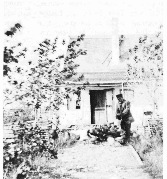
Top left: by 1926 the population served by this little schoolhouse was declining. Right: the students of 1915. Bottom left: the strassendorf was built along the main colonization road of the Interlake. Right: Frank Lavitt's garden in 1916.

That first agricultural venture took place at Hirsch, about 200 km southeast of Regina, near the U.S. border. A colony was established there in 1884 only to be overwhelmed by the devastatingly early frosts of 1885 and by the severe drought of 1886. The colonists struggled on for three years until a fire in late 1889 destroyed much of the stored hay, a disaster that led to the eventual collapse of the colony.